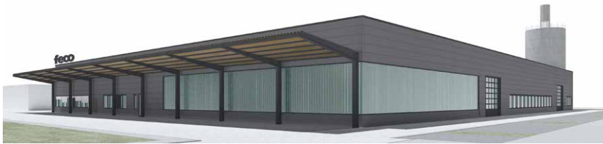
2022/23: New building of our production hall